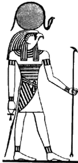
Ra the Egyptian Sun God

Unfortunately the Egyptians did not awaken from their distortions and misunderstood the 'Law of One' and started to worship Ra instead as their God of the Sun. Since the teachings were not really grasped, the distortions of the 'Law of One' continued for the Earthlings.